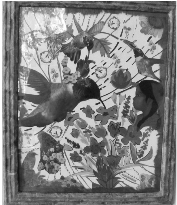
In the Garden of the Mind Gayle Swanbeck