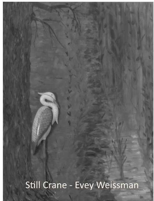
Still Crane - Evey Weissman

Fee: $10, drum loaner by donation payable to instructor.