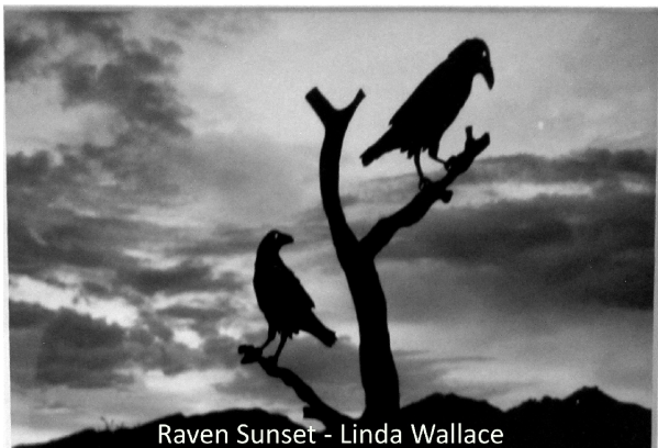
Raven Sunset - Linda Wallace