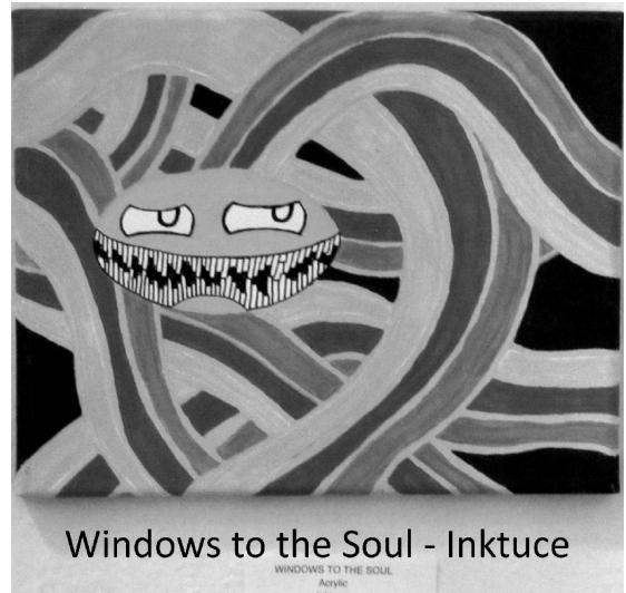
Windows to the Soul - Inktuce