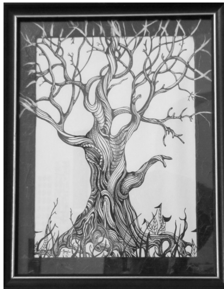
Fantasy Forest VIII - Gayle Swanbeck