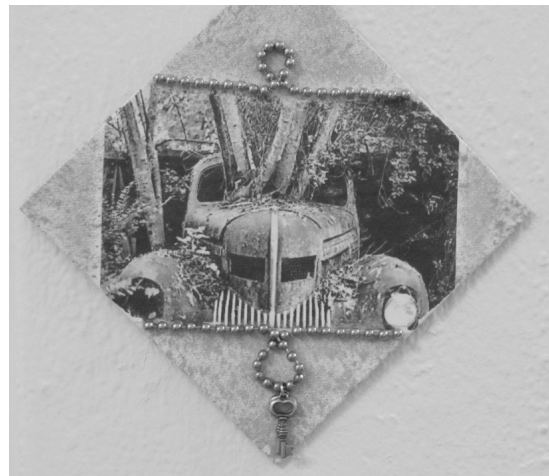
The Good Old Days - Linda K