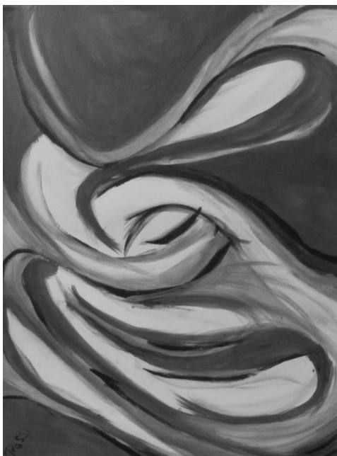
Lucha by Estella di Rossi