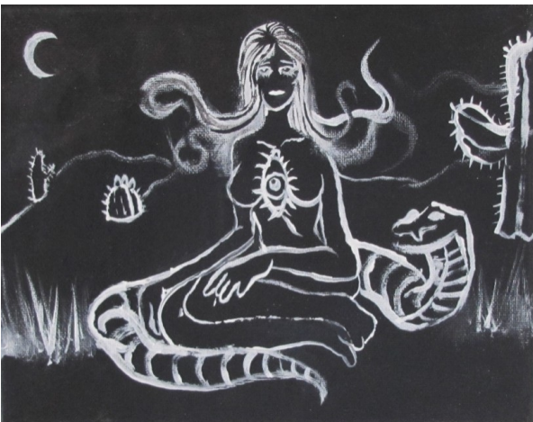
Exposed - Cora Chance

for more info call Bonnie Powers at 520-302-0995