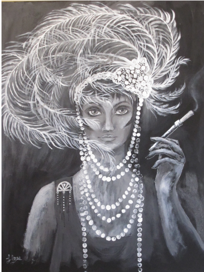
Feathers and pearls, acrylic by Lonni Lees

September-December, 2017 WomanKraft Art Center's Newsletter Volume 53