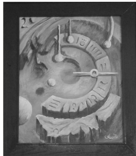
Neolithic Time Piece - Tony DiAngelis

We are currently looking for a volunteer with a big truck (but an even bigger heart!) to help us with occasional scheduled pick-ups from the community. Please call 629-9976 to discuss.