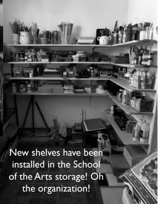
New shelves have been installed in the School of the Arts storage! Oh the organization!