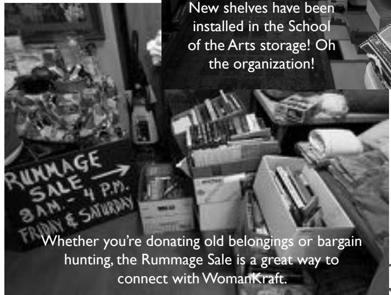
Whether you're donating old belongings or bargain hunting, the Rummage Sale is a great way to connect with WomanKraft.