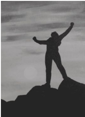
Bp - Freedom