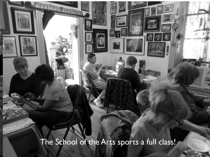
The School of the Arts sports a full class!