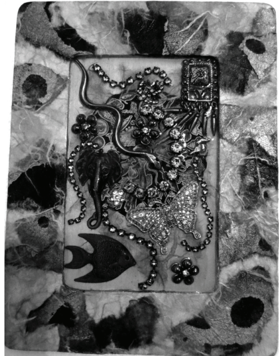
Walking Through Wildlife Dreams by Gayle Swanbeck