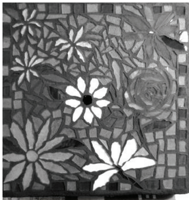
A Stepping Stone from Workshop by Zoe Rhyne