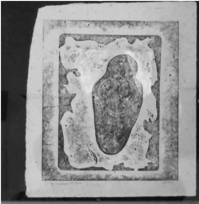
Bp - Goddess Mother