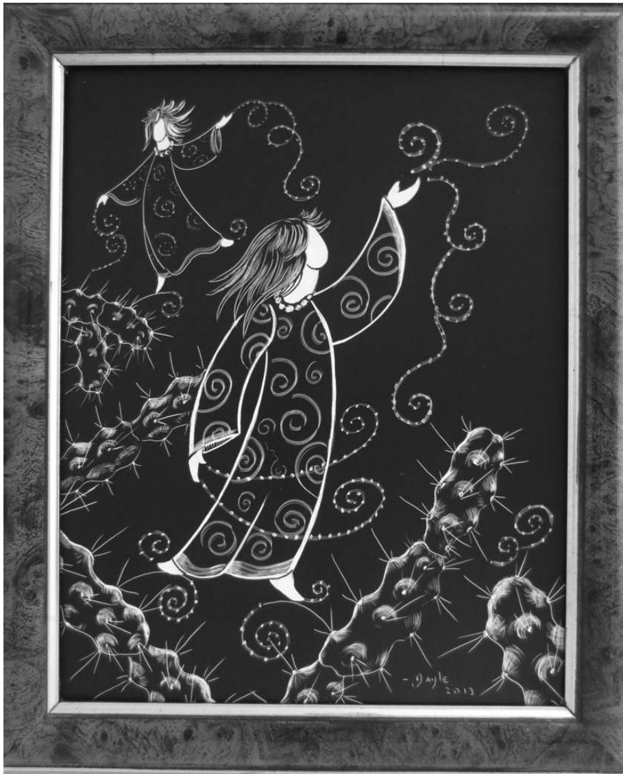
"The Sharing of the Spirals" Gayle Swanbeck 2013 Scratch Art on Clayboard.

September-December, 2013 WomanKraft Art Center's Newsletter Volume 41