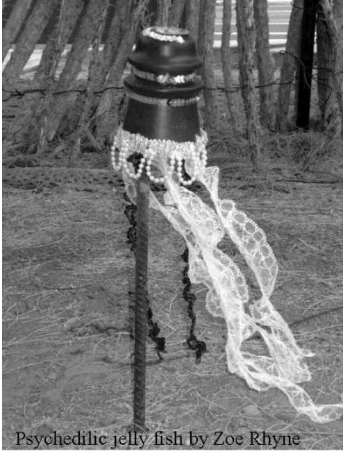
Psychedelic jelly fish by Zoe Rhyne