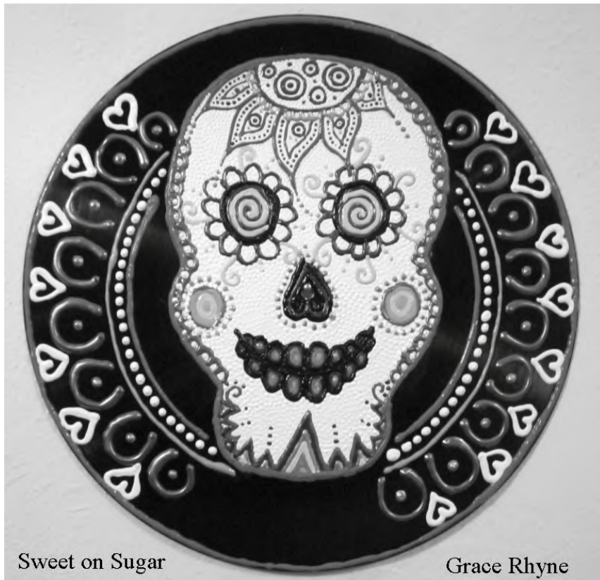
Sweet on Sugar